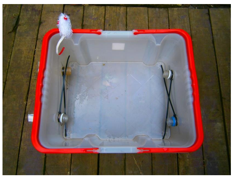
The box, the cable ties secure the funnels.

The disadvantages, which I find are small, are that they cost more (£3 or £4), take longer to make, are awkward to carry for a distance, and reduce the "spread" of traps around the pond compared with bottles. They may be more vulnerable to human interference than bottle traps at some sites.