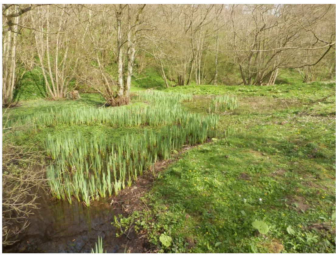
The remains of the Millpond, now full of Yellow Flag Iris, with the dam in the background.