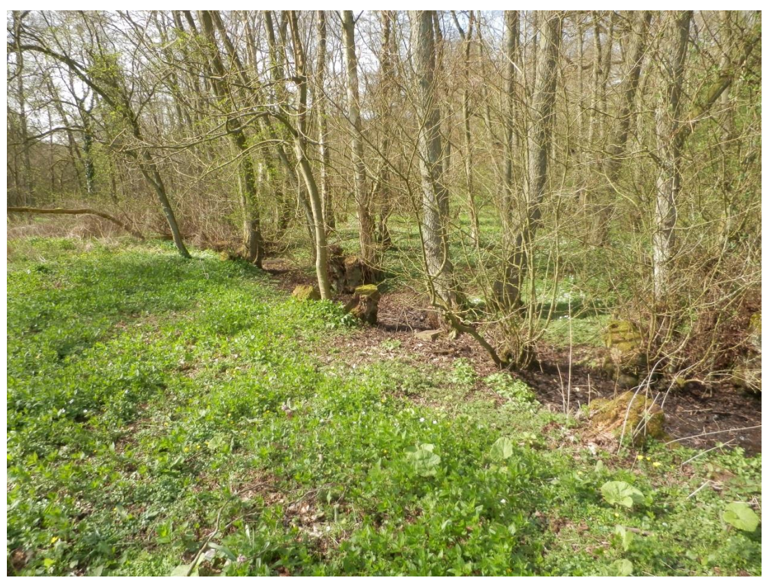
The remains of the millrace, now lined by Alder trees, near the small oval pond next to the main track.