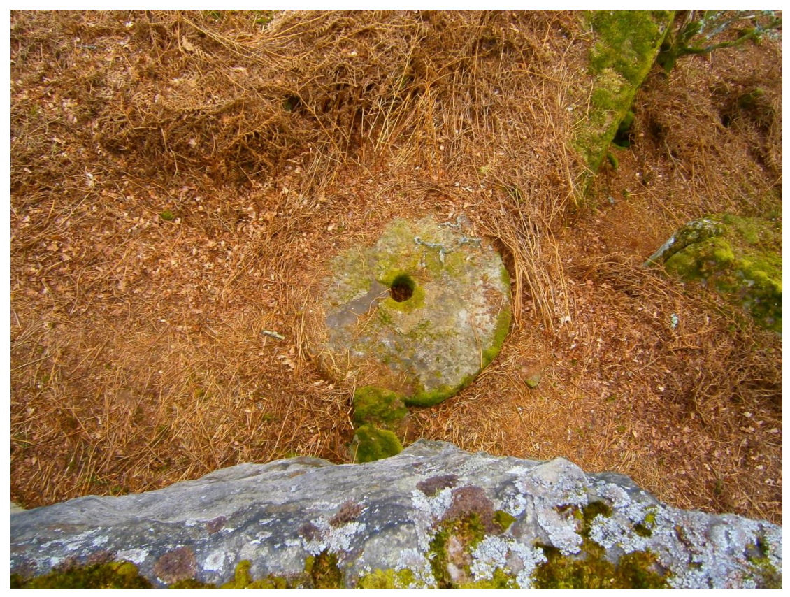
An unused and abandoned millstone, about 1.60 metres across, viewed from above, quarried in the upper part of Deepdale