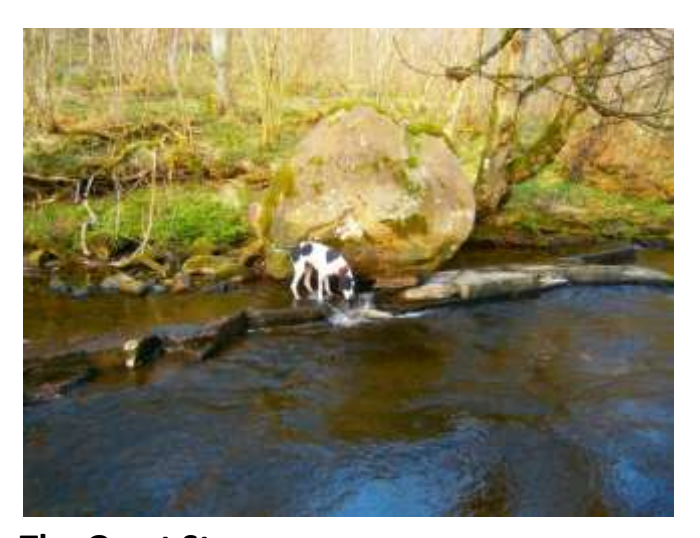
The Great Stone

The path follows the beck, until a large fallen tree has collapsed the original streamside footpath. At this point you leave the Nature Reserve, but you are still on a public footpath. Return to the Beck after the fallen tree, and stay alongside the Beck – the path becomes narrower here. After crossing a side stream called the Smart Gill, the Great Stone is through a gate on your right, a nice little spot to watch the Beck flowing over its limestone bedrock. The Great Stone is a pink granite "erratic", brought from Shap Fell by an ice sheet during the last ice age.