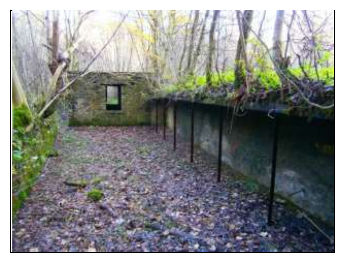
The rifle range buildings

For the circular walk, cross the Ray Gill footbridge and turn left through an area of "coppiced" woodland. Turn right onto the level path, and after 100 metres cross the Deepdale Beck over a second footbridge. Turn right, and follow the beck upstream. The building on your left is the remains of an old shooting range from the First World War. It can be handy if there is a shower of rain.