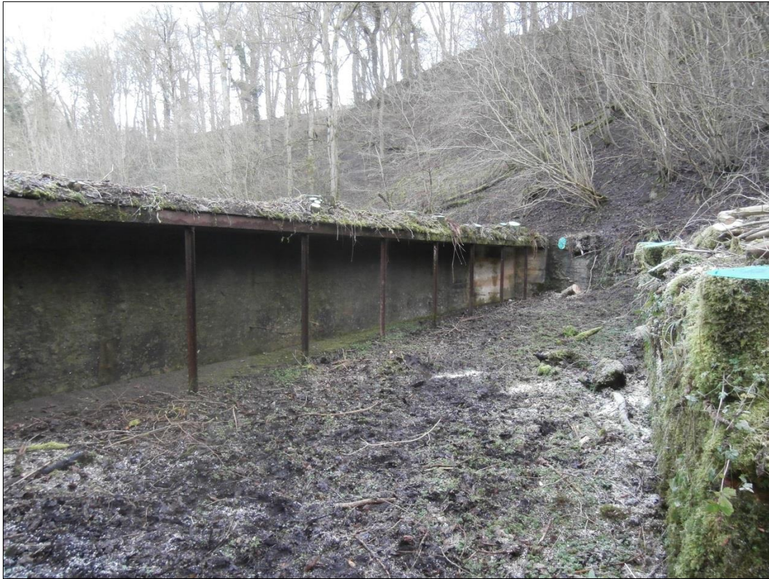
Safe zone under target line (after trees removed)