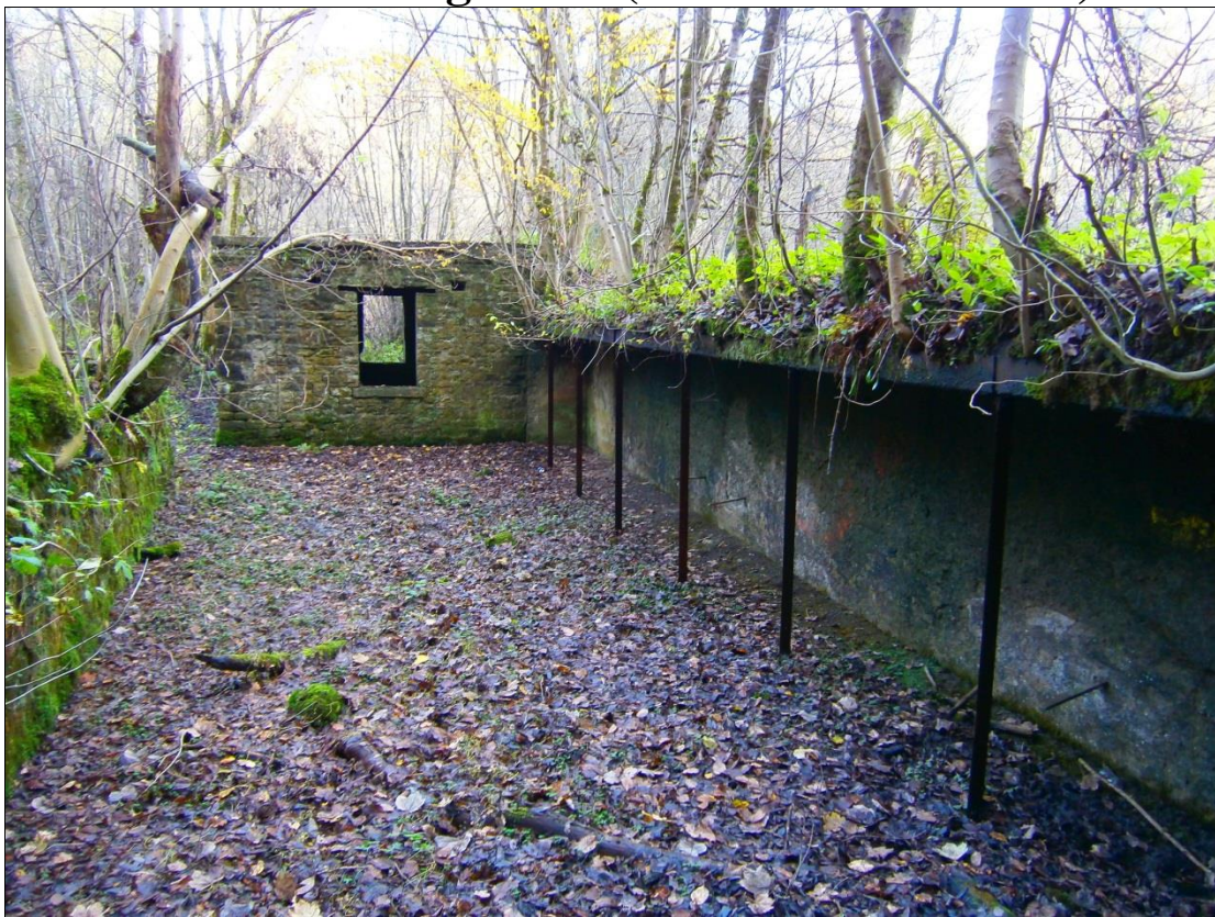
The safety zone at the target area and stone building (before trees removed)