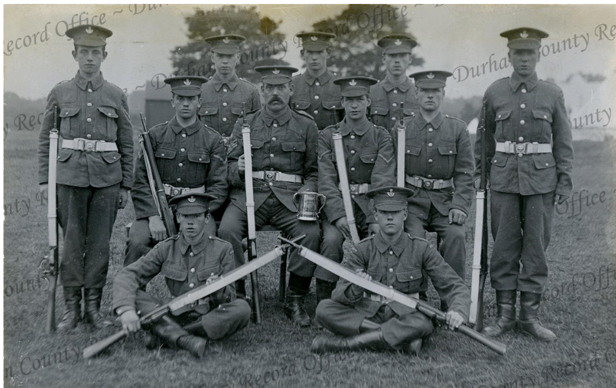
A Deerbolt Shooting Team

Reproduced by permission of the Trustees of the former DLI and Durham County Record Office Durham County Record Office D/DLI 7/602/16(285)