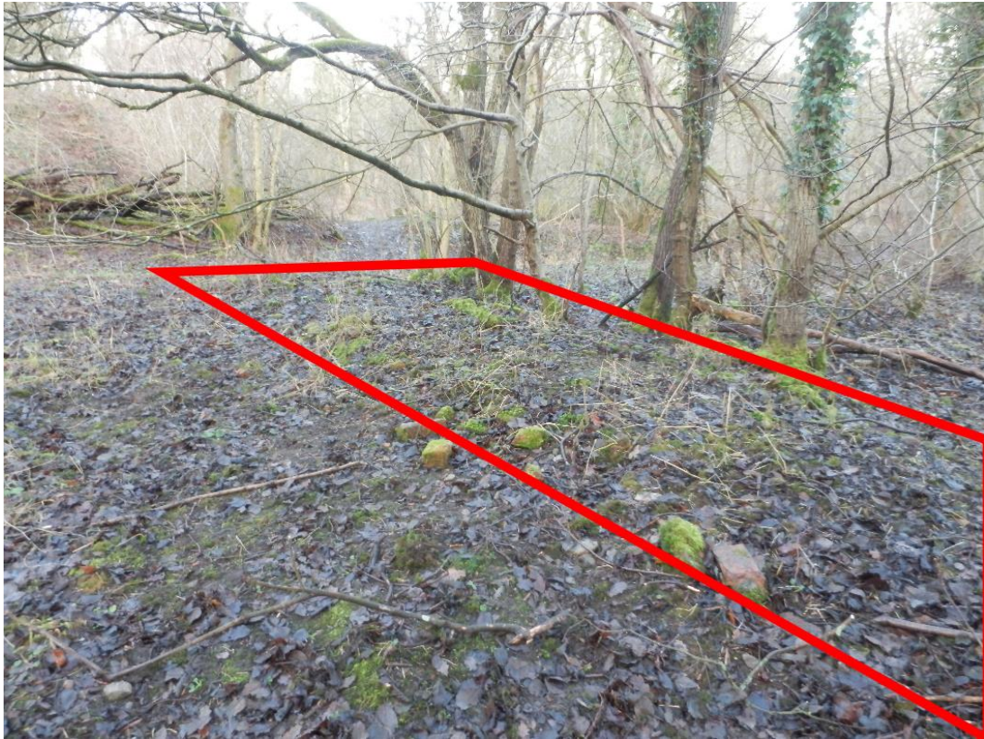
400 yard position, raised area and brick foundations.