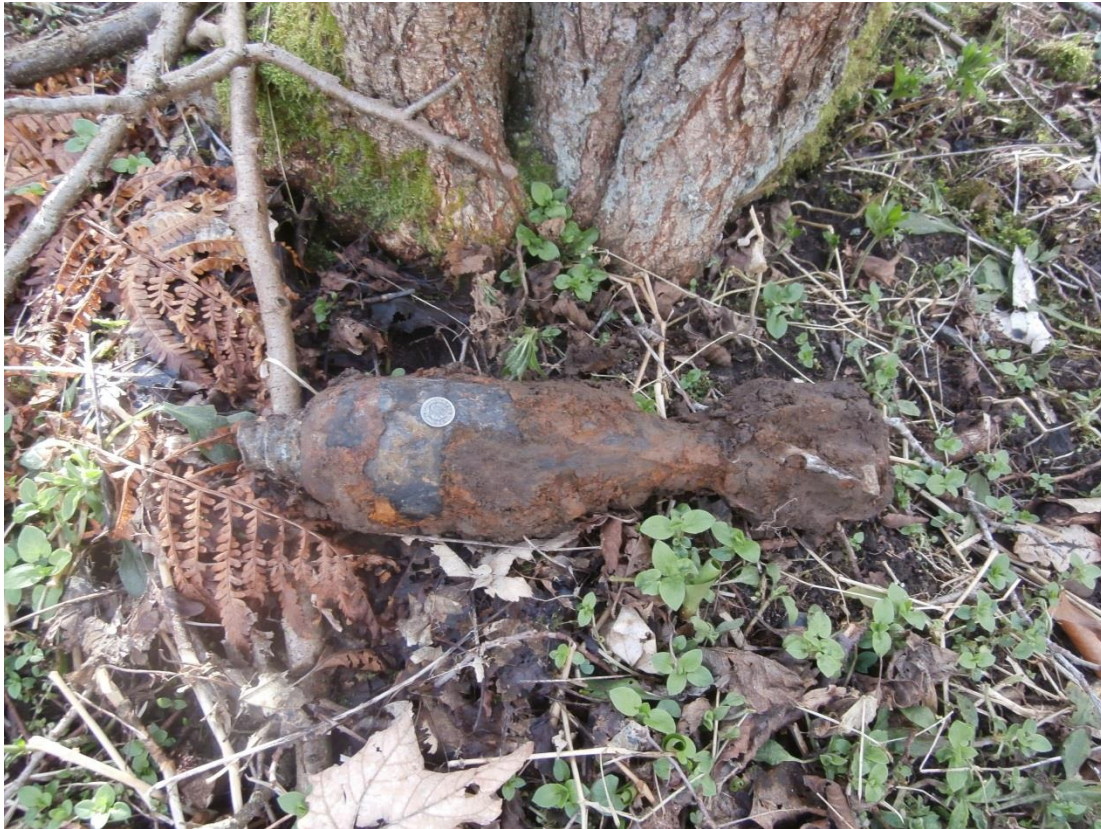
Mortar-type shell, 20p for scale