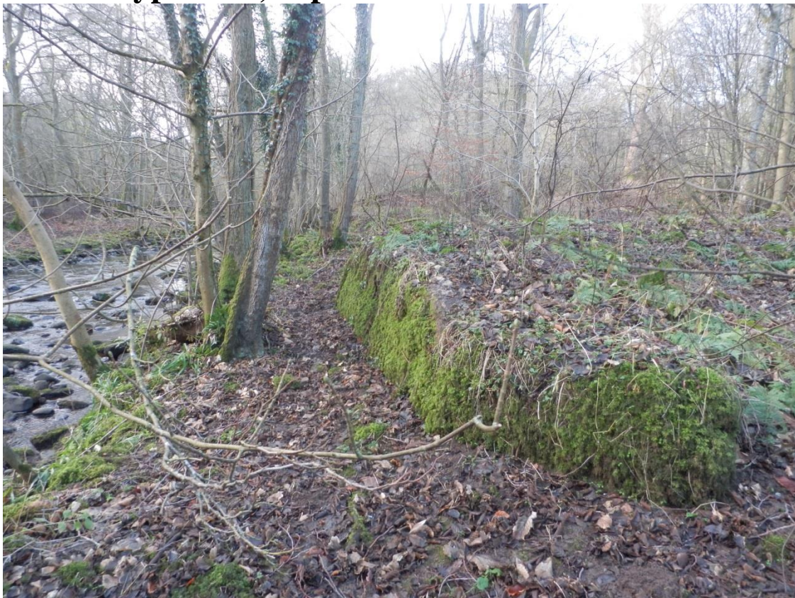
Raised shooting position at 500 yards