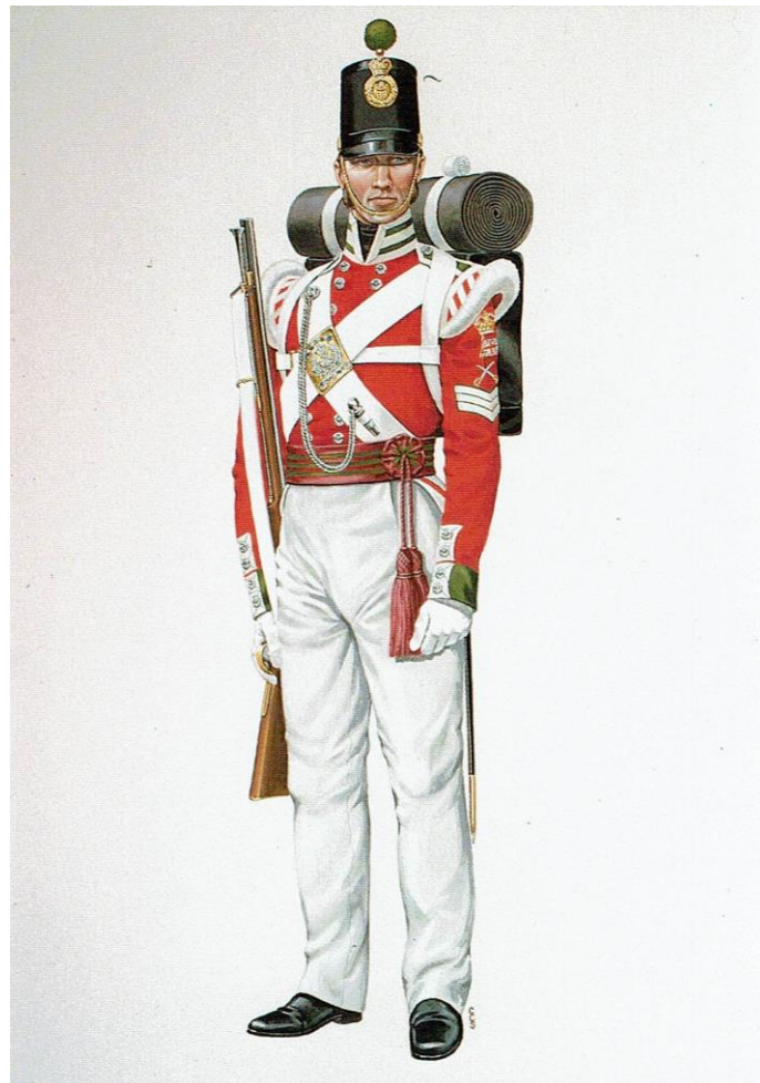
Sergeant, 68 th Regiment of Foot, later included into the Durham Light Infantry. (Old postcard)